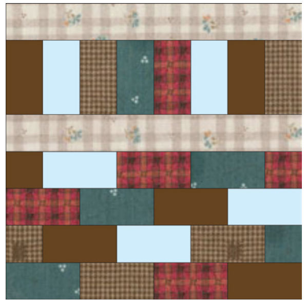
An original block by April Rosenthal of Prairie Grass Patterns. http://www.aprilrosenthal.com

Assemble block as shown, pressing seams to the side.